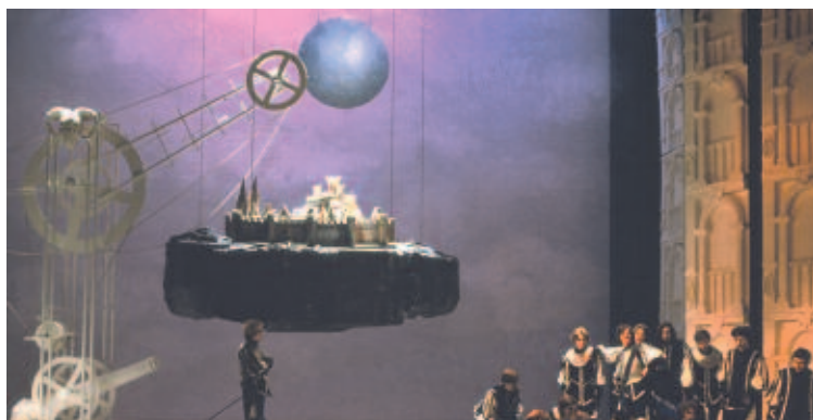
Cyrano de Bergerac - National Theatre of Belgium