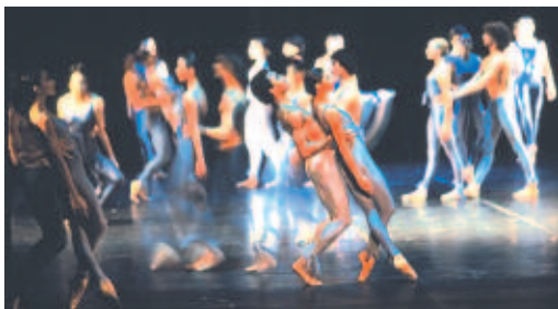
Light - Ballet of XXe century