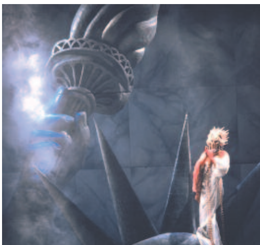
Caligula - National Theatre of Belgium