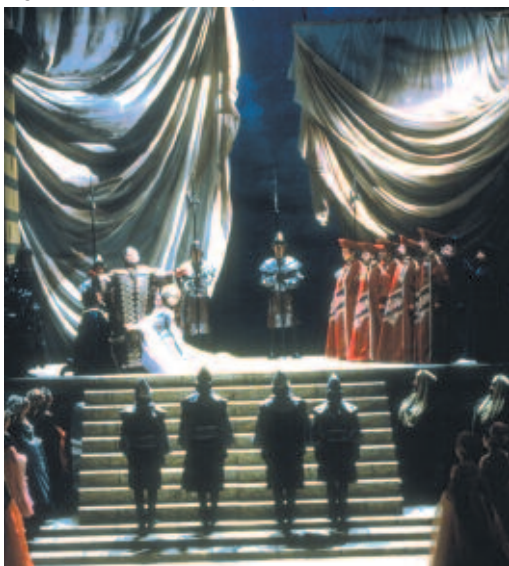
Bocca Negra - Royal Opera of Wallonie