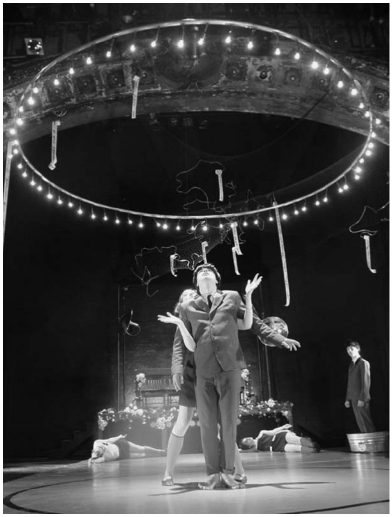
The cast of New Paradise Laboratories' The FAB 4 Reach the Pearly Gates, 2003.

The overall experience of each piece, I think, is greater than the sum of its described elements. The pieces work best with an audience when the image density of the work reaches a critical mass and the elaborate distancing techniques in the piece unite into an effect that is very strongly experiential. The overall effect is not cool and ironic, but supercharged and involving. It verges, in some viewers, on the spiritual. It's not just that questions are evoked, but a questing spirit is engendered in the viewer; a sensation that answers are just around the corner, but that fulfilling interpretability is dangling just out of reach. Viewers feel drawn forward into the piece not by traditional narrative suspense, but by a desire to resolve ontological mystery in general. The sensation and experience of the pieces is exotic, erotically charged, and ravishing.